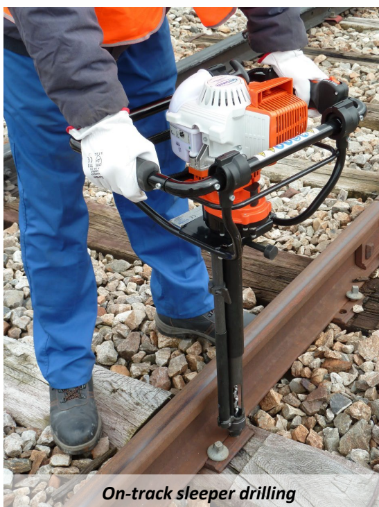
On-track sleeper drilling