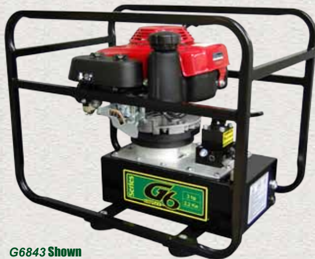
G6843 Shown See table for additional models