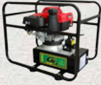
G6843 Shown See table for additional models