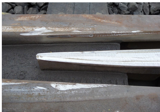
Result after grinding