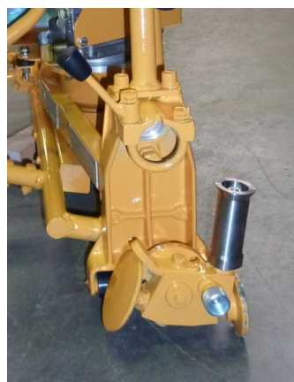
Rollers rotation selector